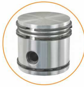
Precision machined alloy pistons for longer life