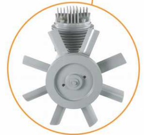
Deep finned cylinders for efficient heat transfer. Large cooling fan covers the entire compressor block