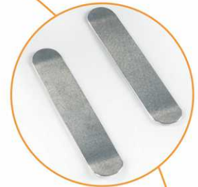
Low wear stainless steel valves